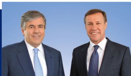
Dr. Josef Ackermann