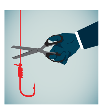
Tenet 5 Protect Your Email Domain Against Phishing